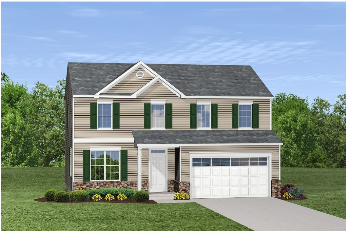
Elevation B with Opt. Stone