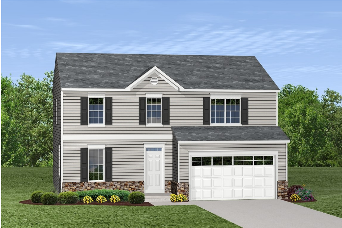
Elevation A with Opt. Stone