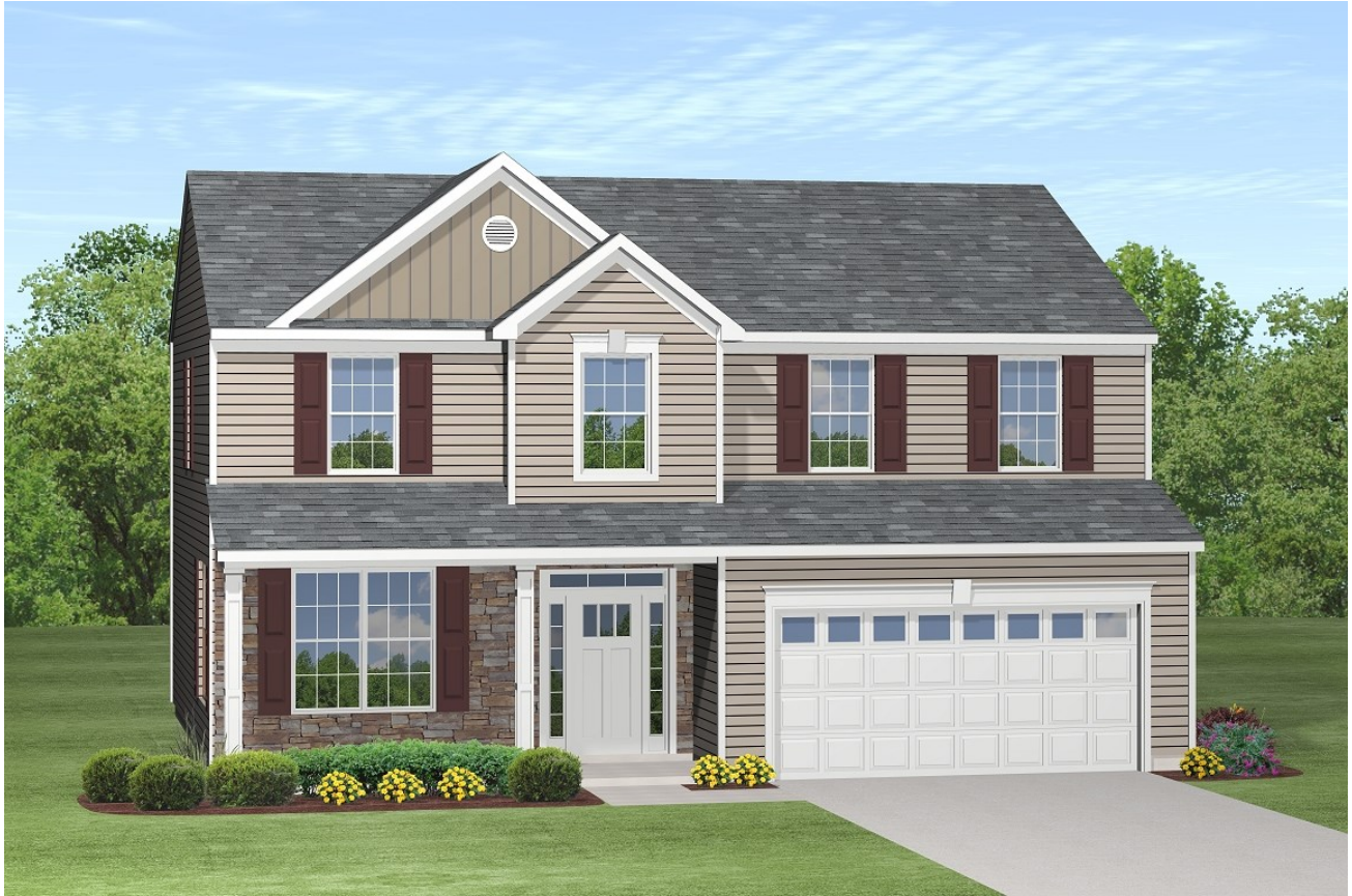
Elevation C with Opt. Stone