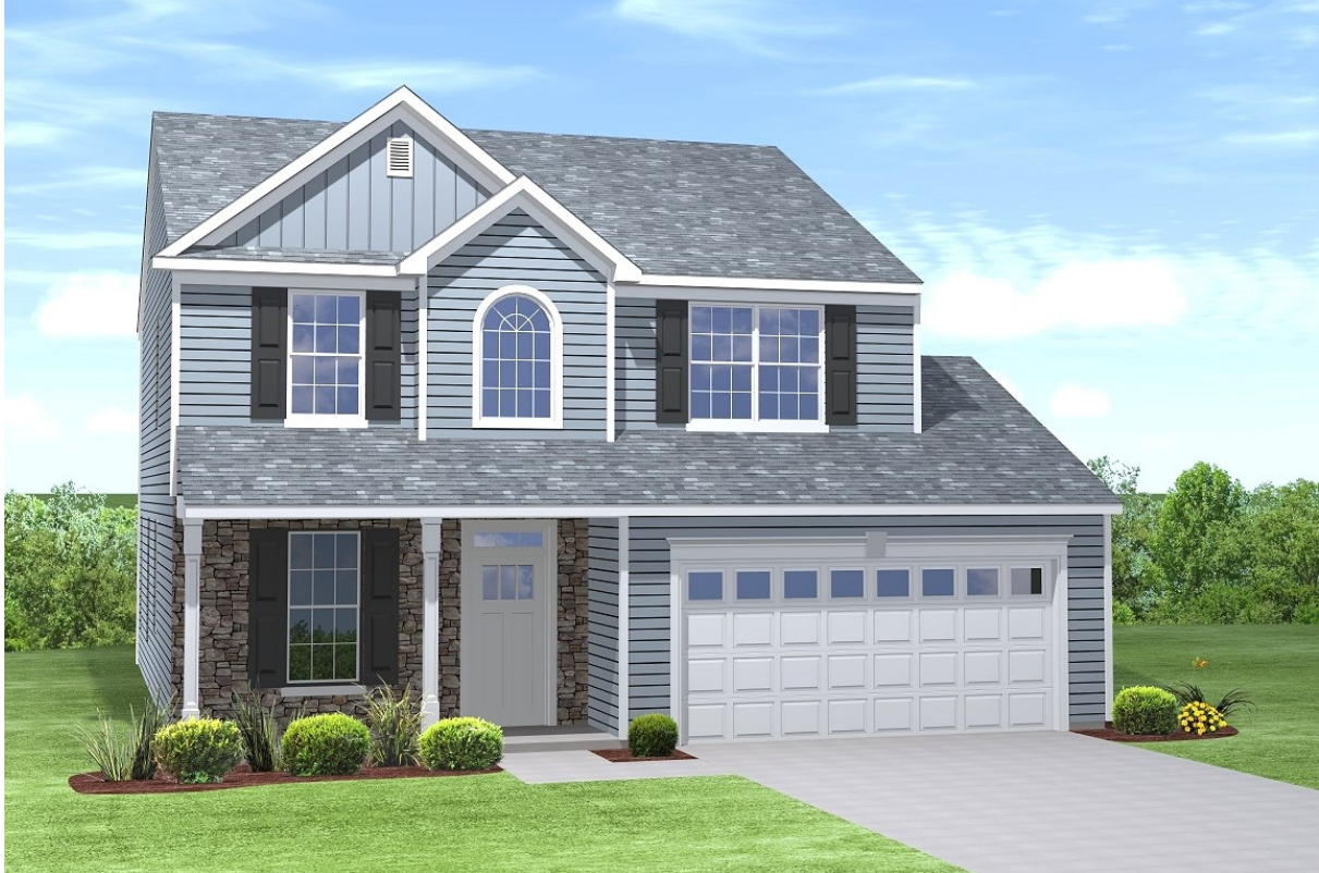
Elevation C with Opt. Stone & 2 Car Garage