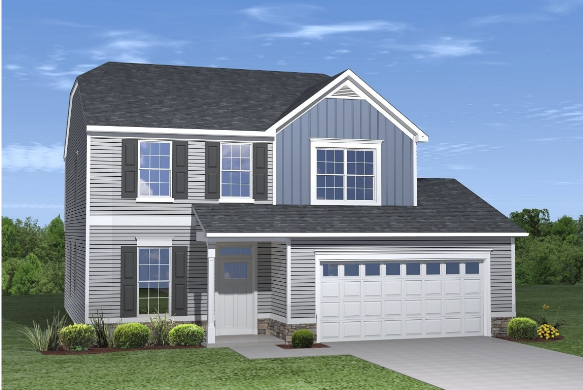
Elevation B with Opt. Stone