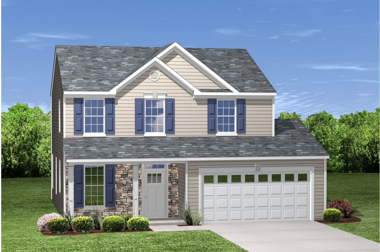
Elevation C with Opt. Stone