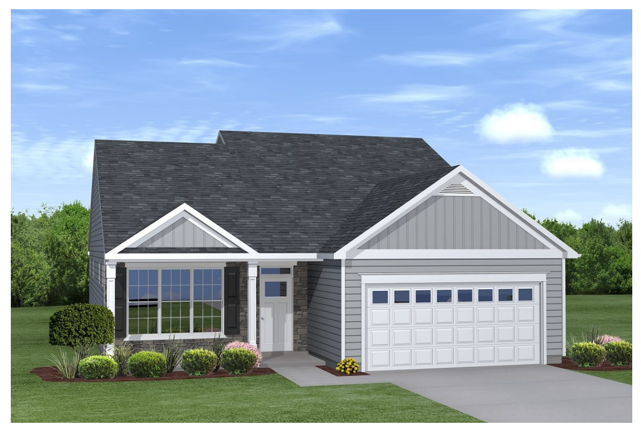
Elevation C with Opt. Stone