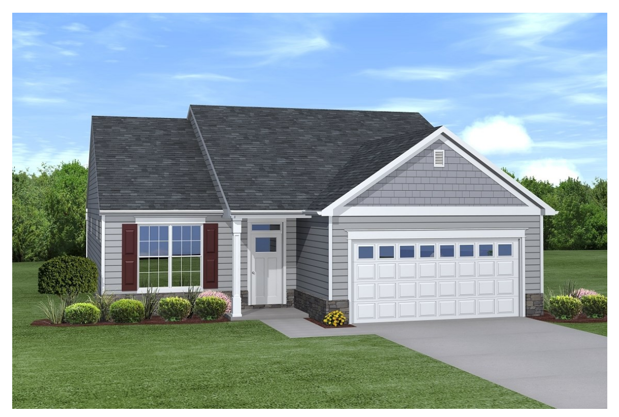
Elevation B with Opt. Stone